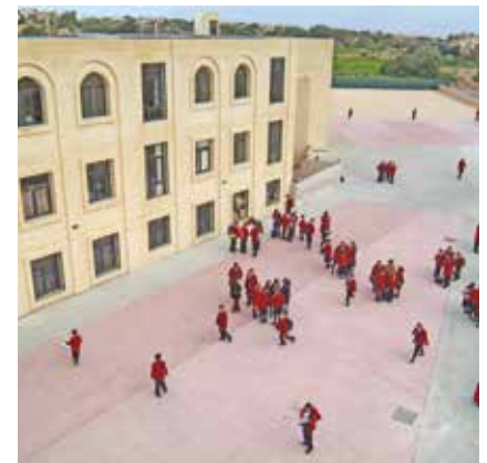
ESE Naxxar School

WI-FI IS FREE AT ESE PACEVILLE SCHOOL, RESIDENCES AND APARTMENTS.