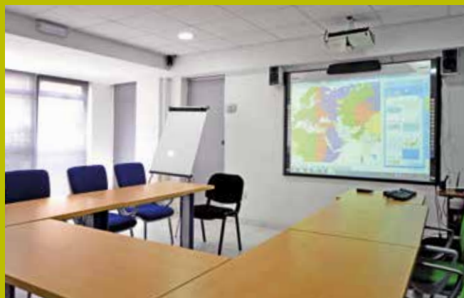
ESE Paceville School

Guidelines and Regulations for TEEN CLUB, JUNIOR CAMP and YOUNG LEARNERS 18