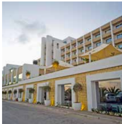
ESE Salini Resort

The ESE annex schools in Salini Resort and Naxxar are situated close to ESE Paceville and are run by ESE Academic and supporting administrative staff.