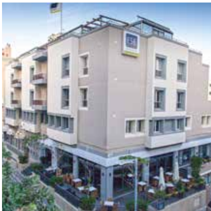
ESE Paceville School

ESE operates from its main school in St Julian's (also housing ESE in-house residence) and an additional two annex schools during the peak season. These are the teen schools at ESE Naxxar and ESE Salini Resort. ESE Salini Resort also incorporates accommodation for students enrolled in Teen Club, Junior Camp, Milan Junior Camp and Young Learners programmes. On arrival, you will be allocated to one of these ESE schools.