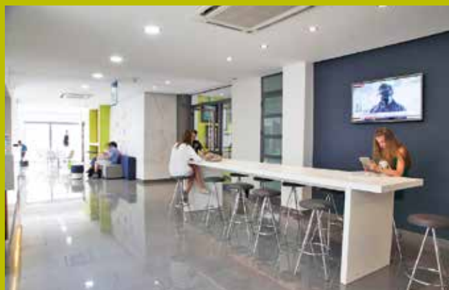
ESE Paceville School